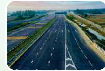
Hyderabad - Nanded Highway తెలంగాణలో మొట్టమొదటి 6 చురుగుల జాతీయ రహదారి