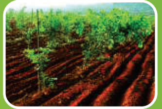
Red Sandal Wood