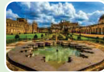
Bidar Fort 25 కి.మీ.లో గల ప్రసిద్ధ పర్యాటక కేంద్రం