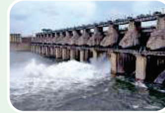
Singur Dam ప్రముఖ మంజీరా నదిపై అతిపెద్ద లజ్జాయర్