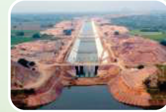
Sangameshwara Basaveshwara Lift Irrigation Project లక్ష ఎకరాలకు సాగునీరు అందించే లిఫ్ట్ ఇరిగేషన్ ప్రాజెక్ట్