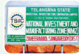
NIMZ - TSIIIC SEZ రెండు తెలుగు రాష్ట్రాలలో అతిపెద్ద ఇండస్ట్రియల్ క్లస్టర్