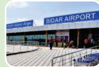
Bidar Airport 30 కి.మీ.లో బీదర్ ఎయిర్ పోర్ట్